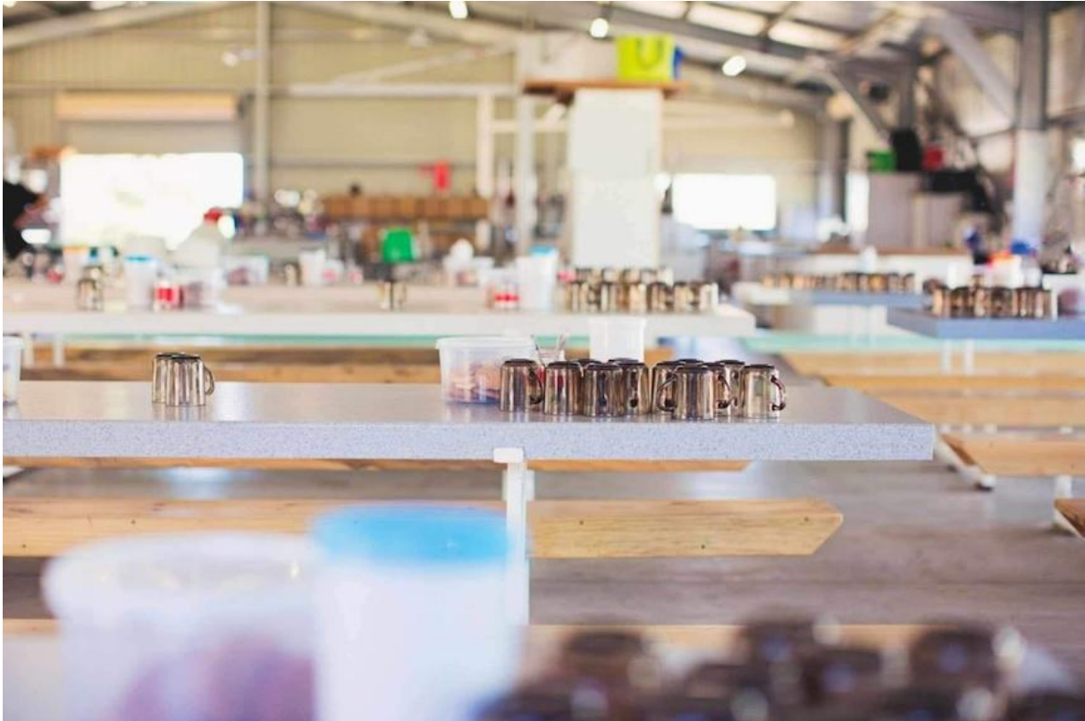
Parts of the convention site are turned into communal dining areas. (Supplied)